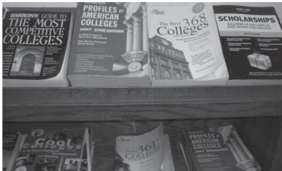
Looking at the college guidebooks in the Guidance Office is great but actually speaking with a university's representative at Molloy's annual Junior-Senior College Night is better.

helpful to students who don't have the time to travel to visit campuses.