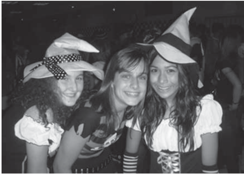
These witches at the 2008 Halloween Dance don't look too wicked.