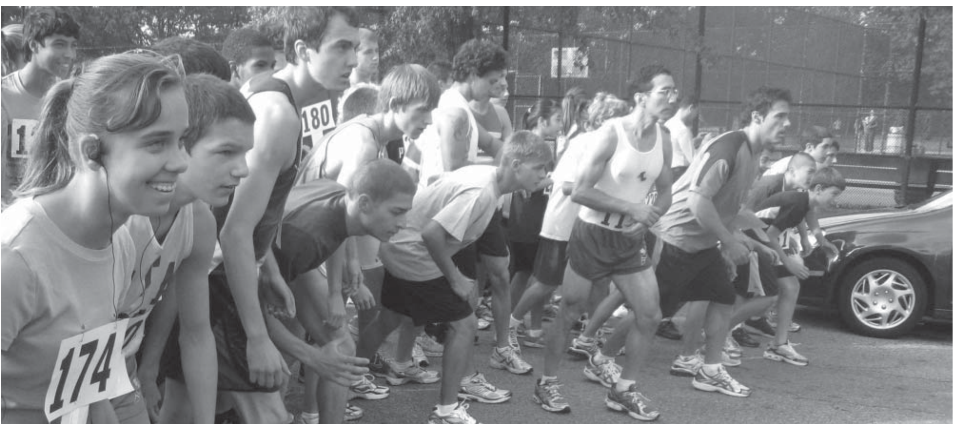
Runners line up for the start of the annual five-kilometer Andrew Harvey Fun Run on Oct. 4.