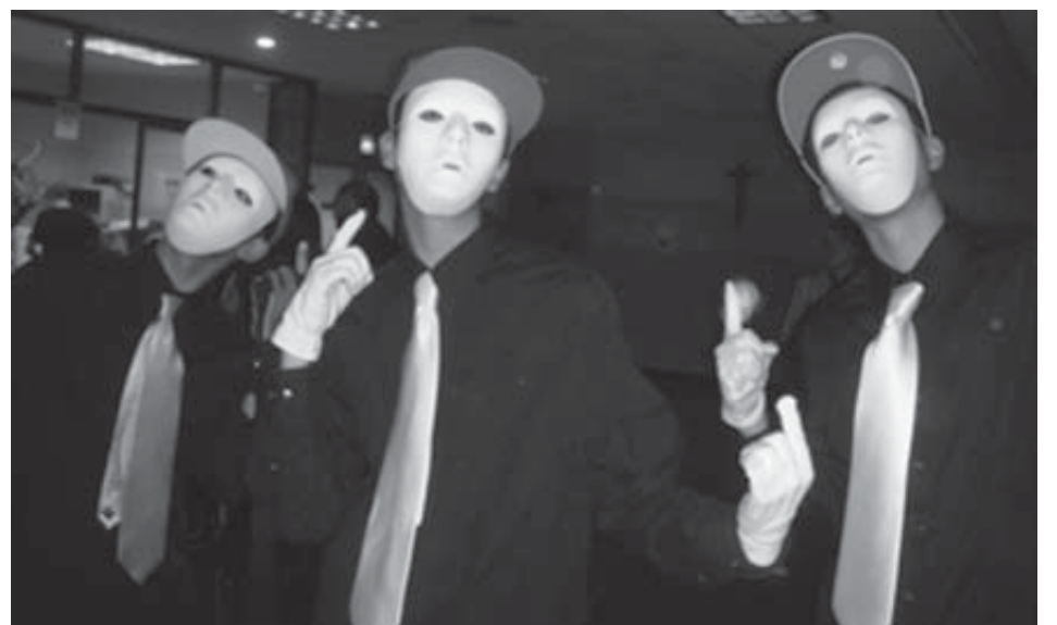
Last year's Halloween Dance in the Cafeteria featured a variety of individual and group costumes and characters.