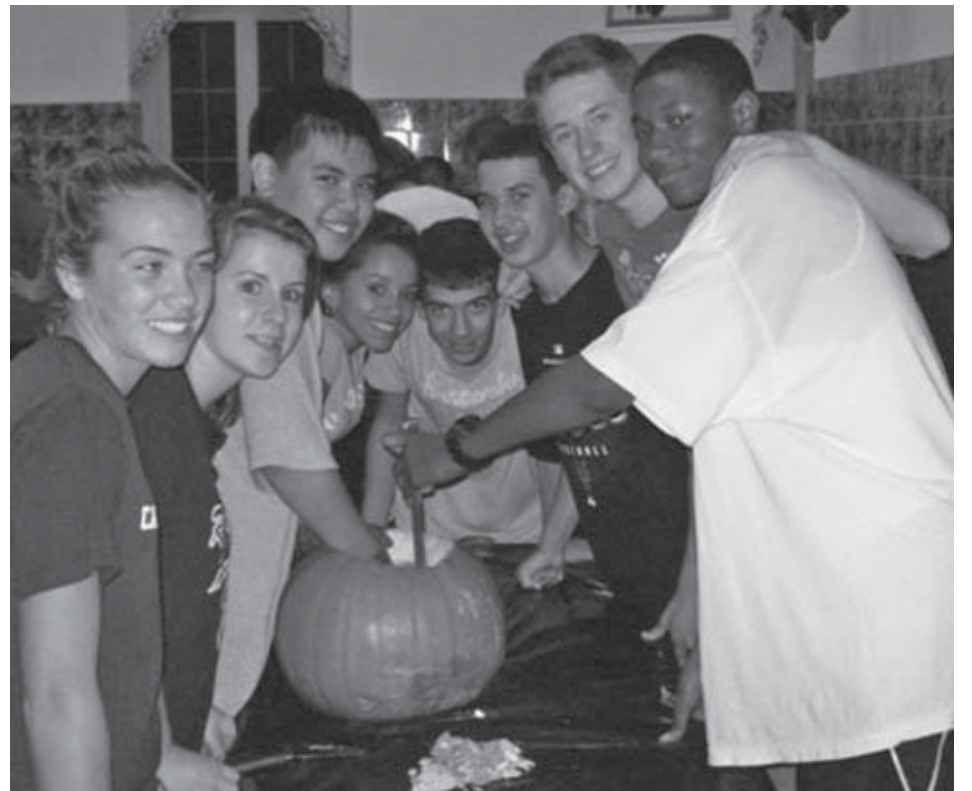
Frosh and their group leaders get their hands a little messy while carving a pumpkin.

"I would recommend it to some people, but not to everyone because I don't think that they would take it seriously," he said.