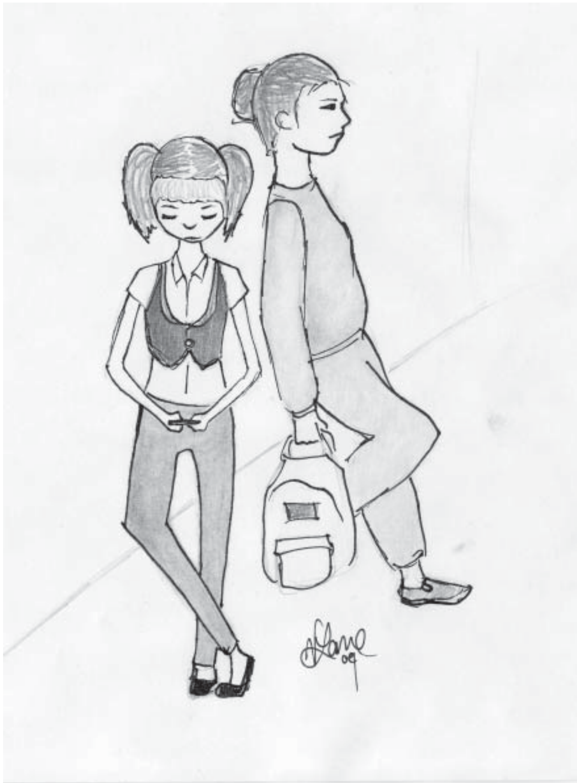
Illustration by Victoria Lane '10