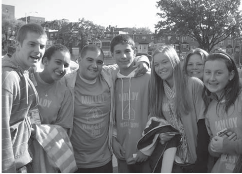
These Stanners, looking tired but happy, celebrate after completing the 2008 Walk-a-thon.