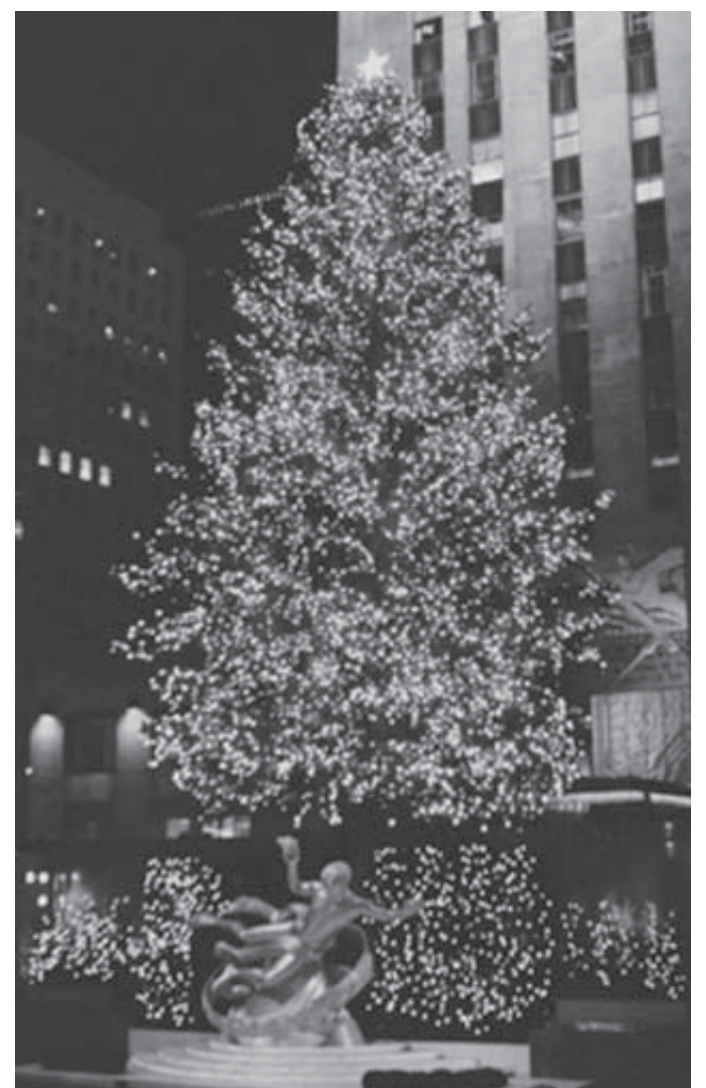
The Christmas tree at Rockefeller Center was a popular destination for Stanners during the break.

"I saw a boy wearing a Marist High School Walk-a-thon t-shirt," he said.