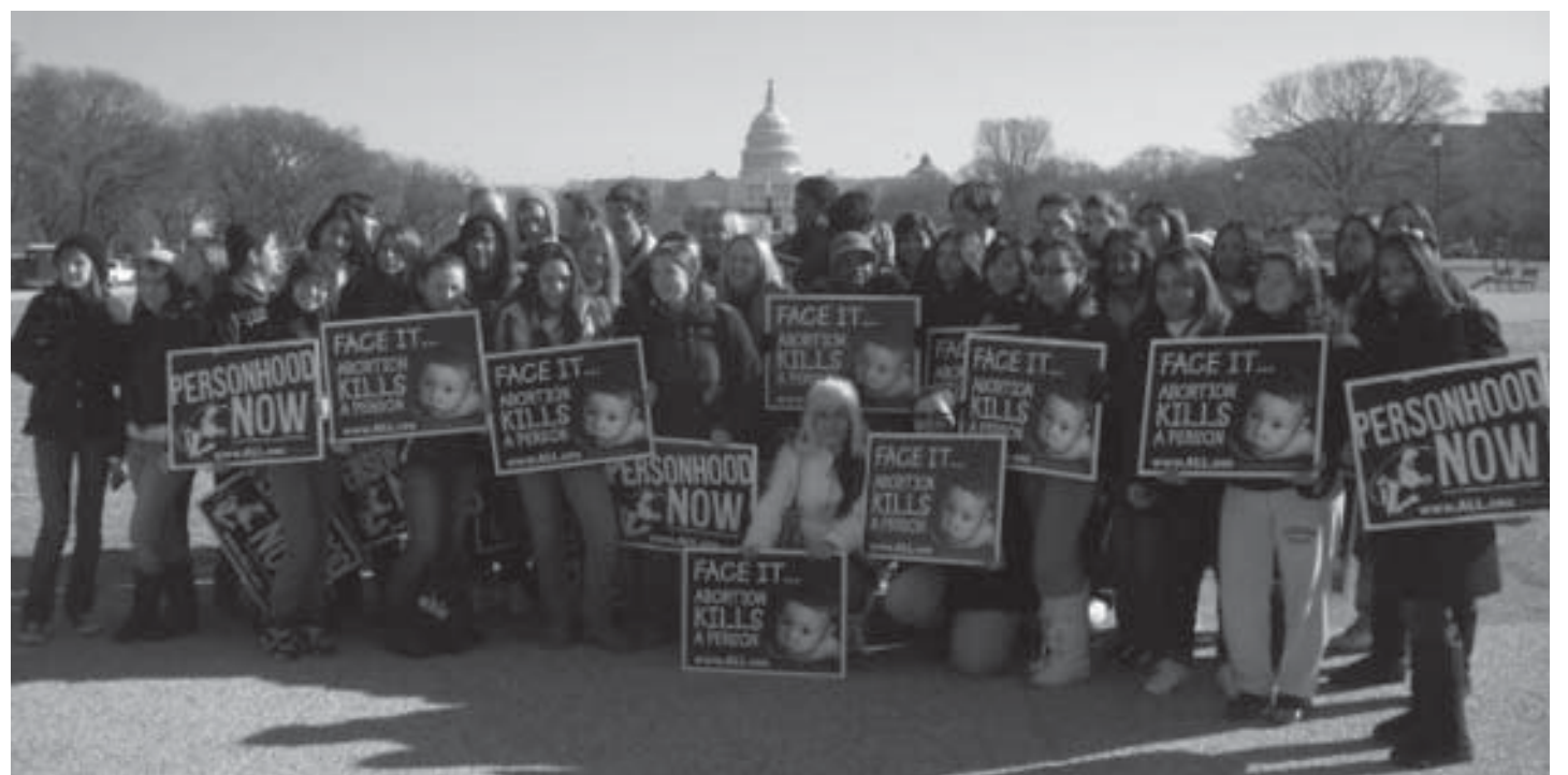
Members of Molloy's Right to Life Club pose last year on the Washington Mall with the U.S. Capitol in the background carrying the signs they used in the March for Life demonstration. The club returned to D.C. last Friday to protest the Supreme Court's Roe vs. Wade decision which made abortion legal.

He said he hoped the march helped students recognize the passion that so many people have for this issue, despite the indifference that most of the media shows for the cause.