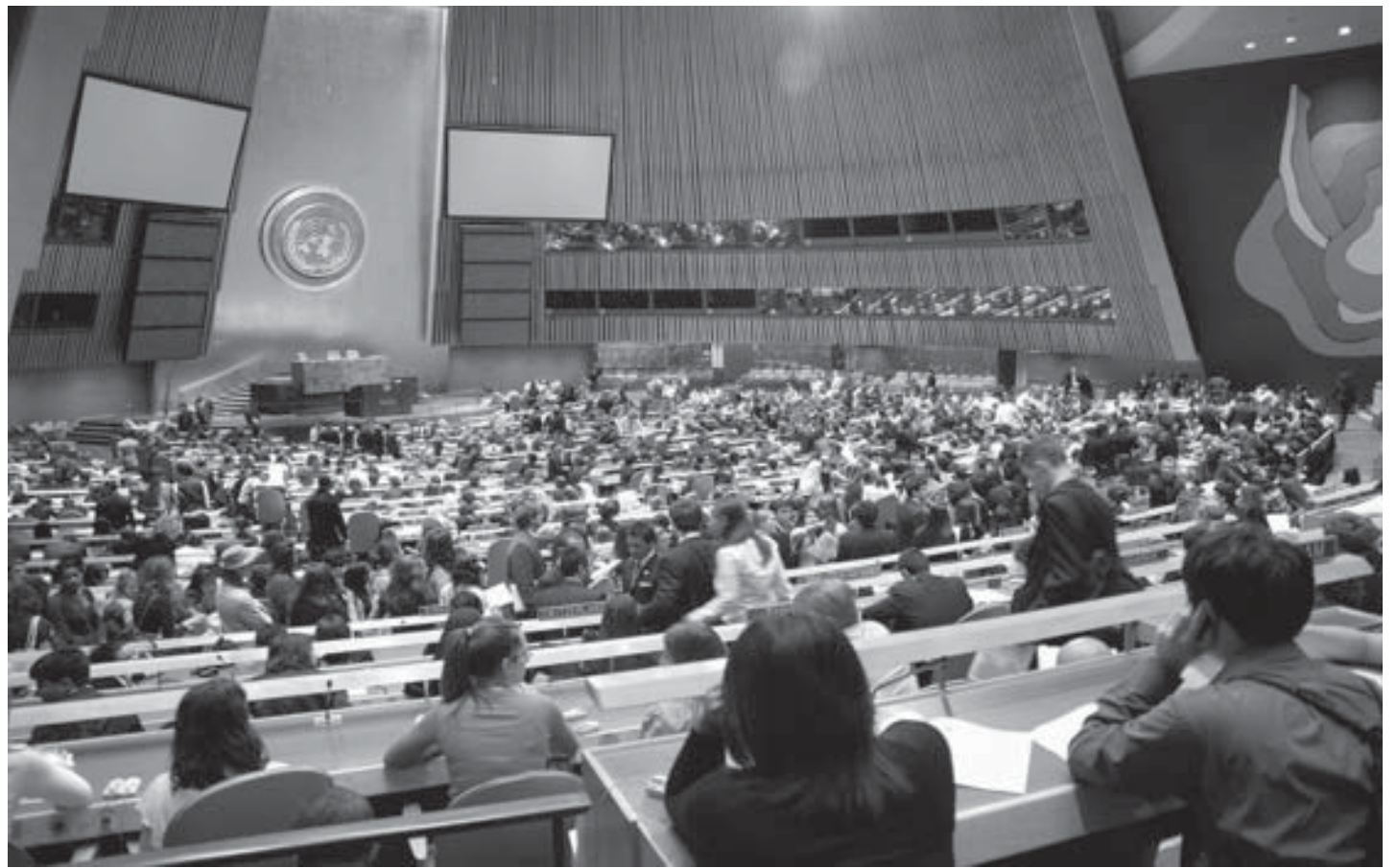
Stanners will again join students from all over the world in the General Assembly at the United Nations Headquarters for the annual Model UN Conference in May.

Molloy was not assigned to represent a major world power again this year.