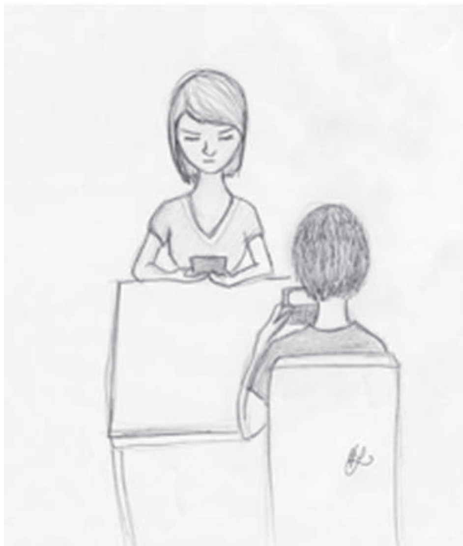
Illustration by Victoria Lane '10

But just as you are getting over the fact that you have a nine-year-old Facebook friend, your little cousin’s mom now requests you, too.