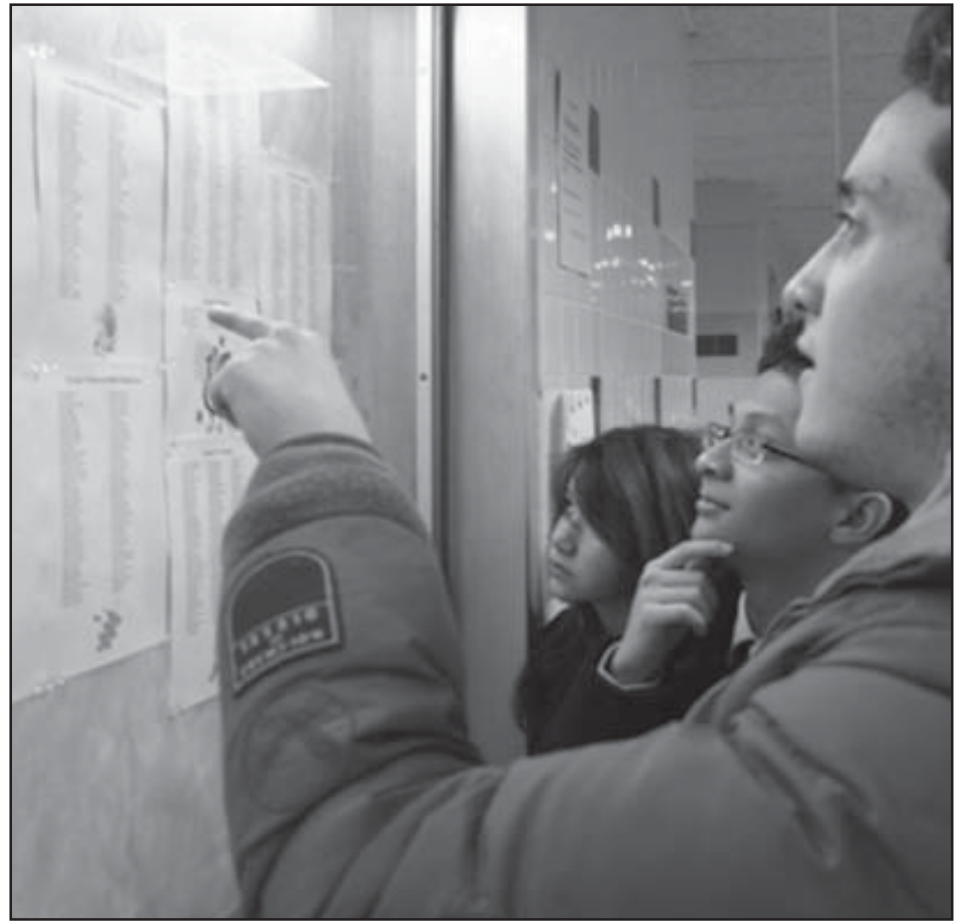
Stanners check out the many names that fill the Molloy Honor Roll and Principal's List due in part to the weighted grades given to students enrolled in Honors and AP classes.

different levels of classes can spur regular students to work harder so that in the following year they may be bumped up to an Honors or AP class so they may reap the rewards they deserve!"