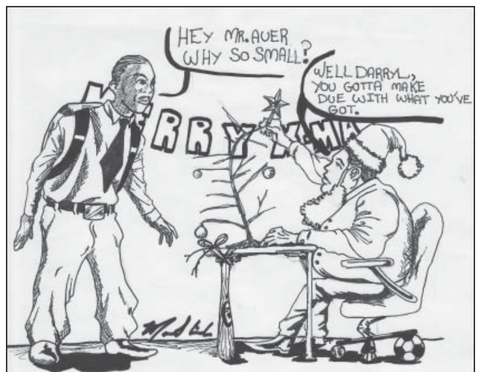
Illustration by Manuel Cordero '09