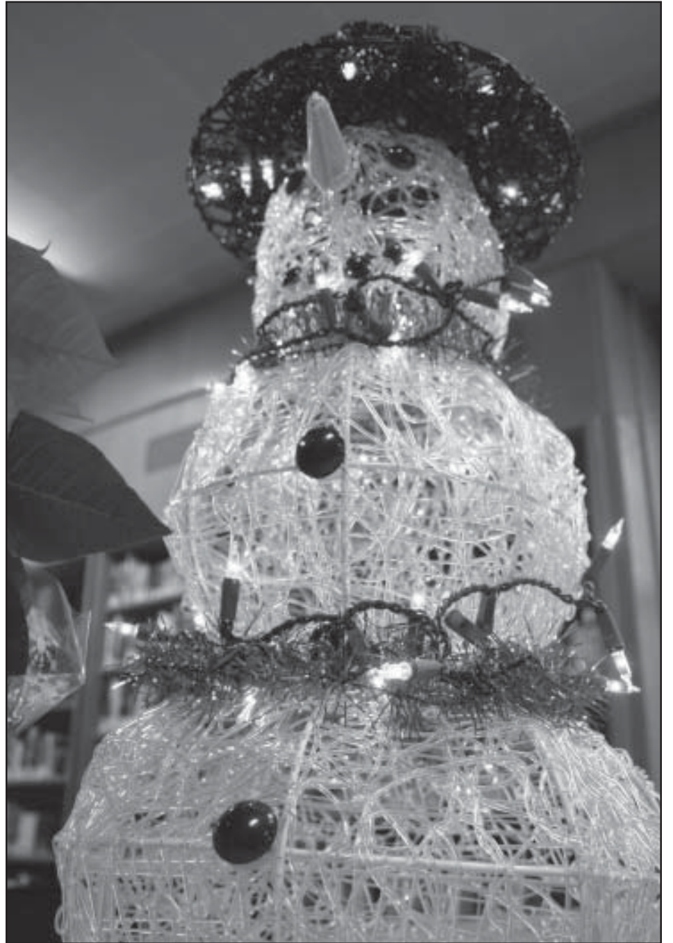
An electric snowman decorates the Library.