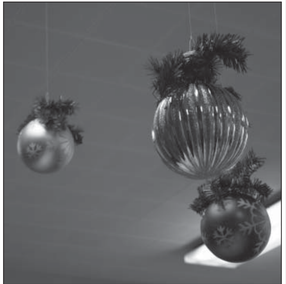
Ornaments decorate the cafeteria ceiling.

‘It’s beginning to look a lot like Christmas . . .’