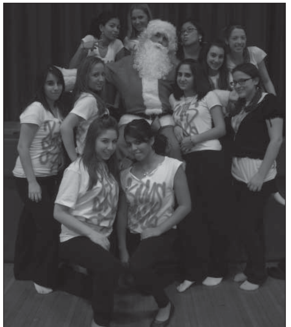
Santa, seen here last year, must wait until next year to again be part of the Dance Club's Christmas Show.